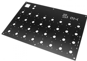
Laser Engraving LOGO